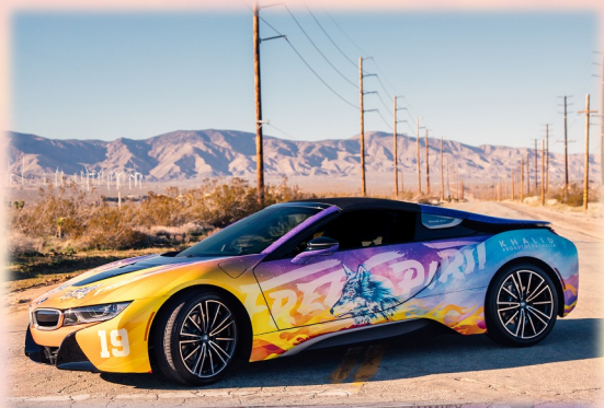
Image branding is high profile penetration in a prestigious environment that truly sends the “right” message about your brand of community involvement, support for a worthy charity and a popular local event in one of America’s most affluent counties. (A portion of net proceeds benefits local charities.)